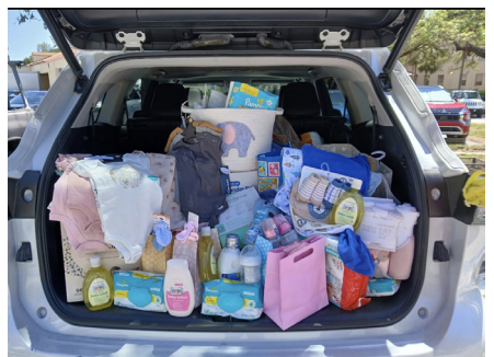
Donations for veterans baby shower at the Bay Pines VA Stand Down on April 12