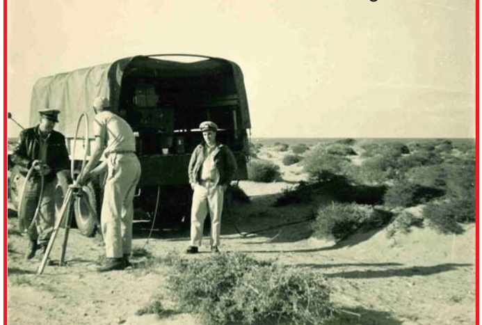
Dec. 1959, in the desert about 250 miles west of Benghazi, Libya, checking field strength measurements of Loran-C transmissions.