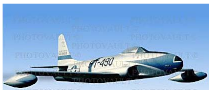
1947: F-80 "Shooting Star"