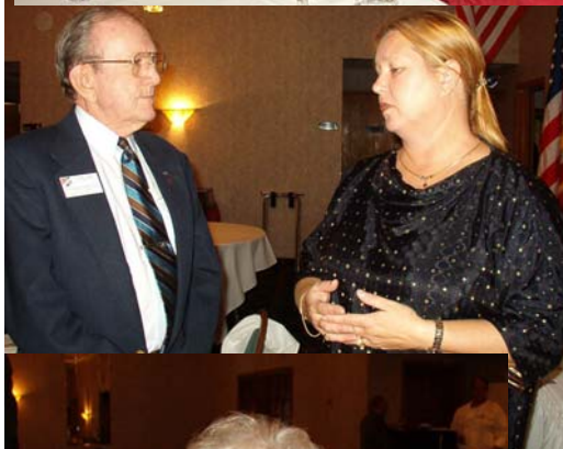
Clockwise from the right: