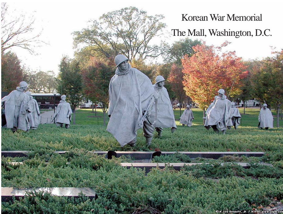
Korean War Memorial The Mall, Washington, D.C.