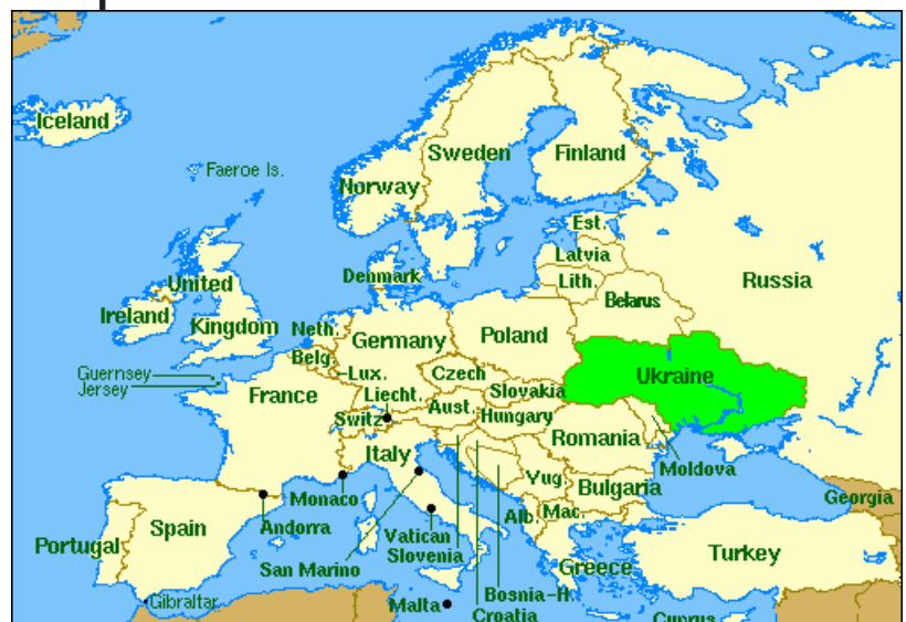
R: pUkraine's position in eastern Europe