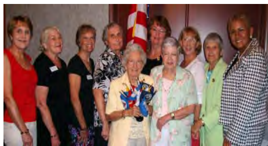
Nurses in Attendance