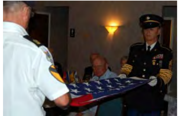
Folding the Flag