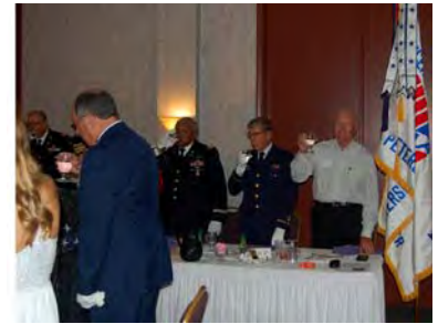
Toast to Fallen Comrades who are still listed as POW/MIA