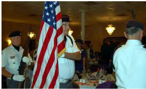
Honor Guard posting the colors