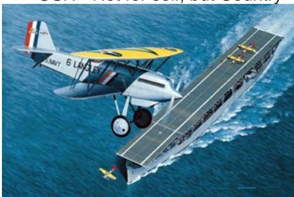
USS Langley, CV-1