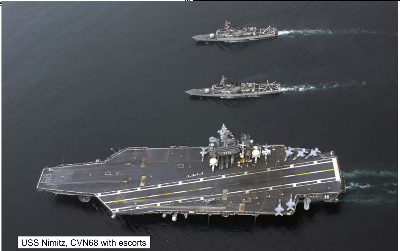
USS Nimitz, CVN68 with escorts