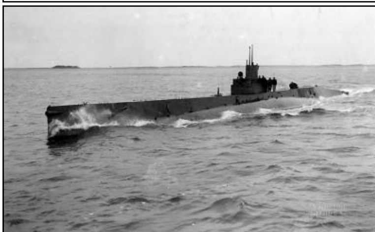
USS S-1, surface trials 4/15/1920, off Provincetown, Mass

II that the Navy grew with development of aircraft carriers, the USS Langley (CV1) was the first. The submarine force grew with development of diesel engines and different classes or types of submarines. The surface ships were also being built larger and with more fire power. The USS Enterprise (CV 6) and her sister ship the USS Yorktown (CV 5) were the first truly satisfactory aircraft carriers built for the Navy with speeds up to 34 knots and space for eighty planes. Training and education also began in earnest as the basic training (boot camp) which lasted for twelve weeks was started. Officers who had strong academic credentials and at least seven years in the Navy returned to the Naval Academy to attend postgraduate school.