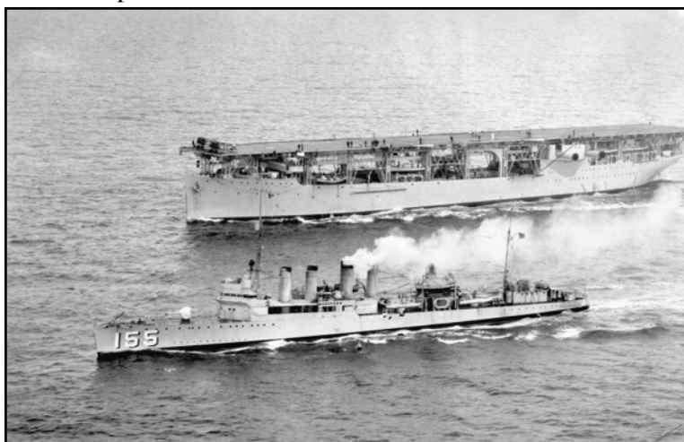
USS Langley, CV1, w/ a 'four stack' WWI destroyer (The Langley was sunk in SEA early in WWII)

It was in the years between the World War I and World War