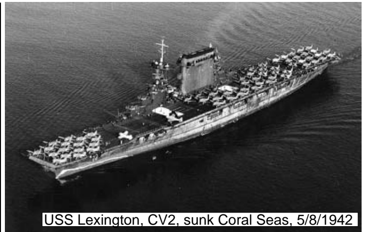
USS Lexington, CV2, sunk Coral Seas, 5/8/1942

Your cards, prayers and thoughts are welcome.