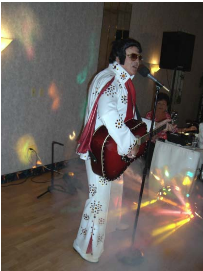
We had Elvis for our Luncheon