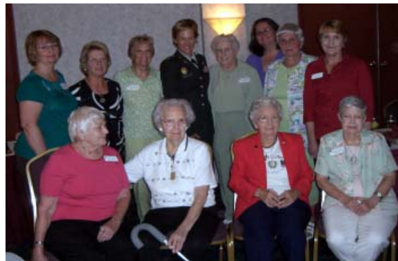
All nurses present