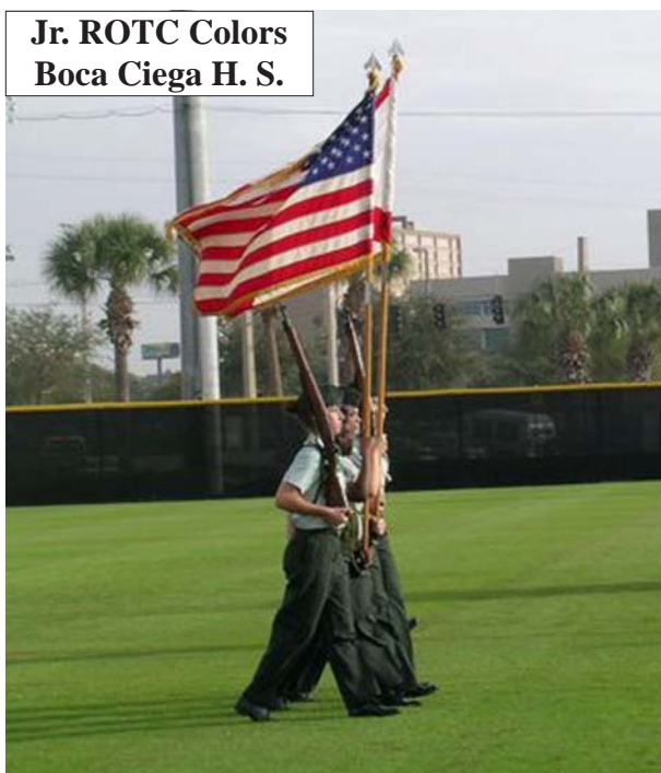
Jr. ROTC Colors Boca Ciega H. S.

Non-Profit Organization U. S. Postage PAID St. Petersburg, FL Permit # 1533