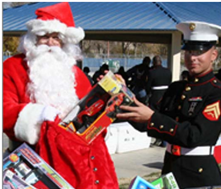
New unwrapped toys