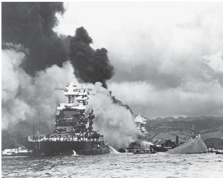
Late morning, December 7 th – USS Maryland before being scuttled; USS Oklahoma after capsizing

still occupied by families. Clothes lines were full, lawns manicured, an island of domestic tranquility – with piles of destroyed aircraft in front of the quarters and sunken battleships behind.