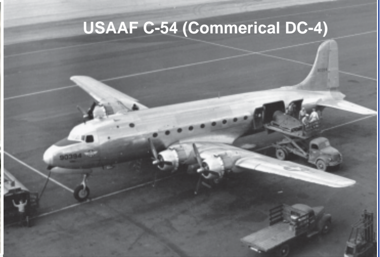
USAAF C-54 (Commerical DC-4)

brought to light an incident that occurred on September 18, 1946, an incident which changed the course of the development of the helicopter as an instrument for the rescue of humans in distress. During the early morning hours on that date, a Belgian Sabena Airlines DC-4 enroute from Brussels to New York attempted to land in bad weather at Gander Airport to refuel and crashed in a heavily wooded area 24 miles from the airport. Of the 54 people on board only 17 passengers and one stewardess survived. Of those eighteen only two were ambulatory, the rest suffering terrible injuries including broken bones and severe burns. It took ground rescue parties the better part of two days to reach the scene. One group flown in to a lake 5 miles from the crash site by Coast Guard PBYS from Argentia, Newfoundland included a U.S. Army Doctor, CAPT Samuel Martin. After a five mile trip by raft down a stream full of rapids, the party and the Doctor reached the scene. Upon treating the survivors and evaluating the severity of their injuries, the Doctor advised the Coast Guard, by radio, that most of the injured would not survive the trek back to the lake over land. He insisted that the survivors be evacuated by helicopter.