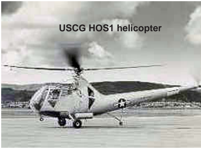
USCG HOS1 helicopter

The extensive news coverage of the very first major airliner crash and the subsequent helicopter evacuation caused the mili-