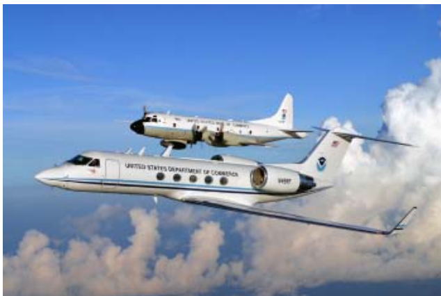
NOAA Hurricane Hunters