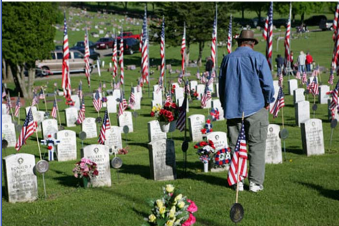
Above – West Point, right – Annapolis, below Memorial Day activities