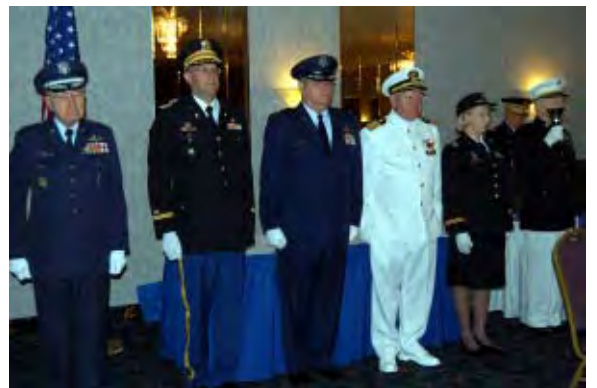
The Honor Guard