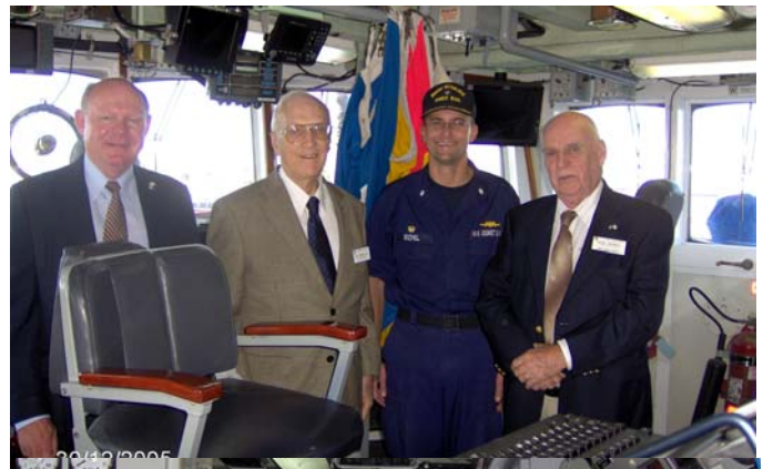
On the bridge & in the engine room

I do have to tell you that I believe the ladders have gotten steeper and more difficult to climb and that the passageways are much narrower than they used to be.