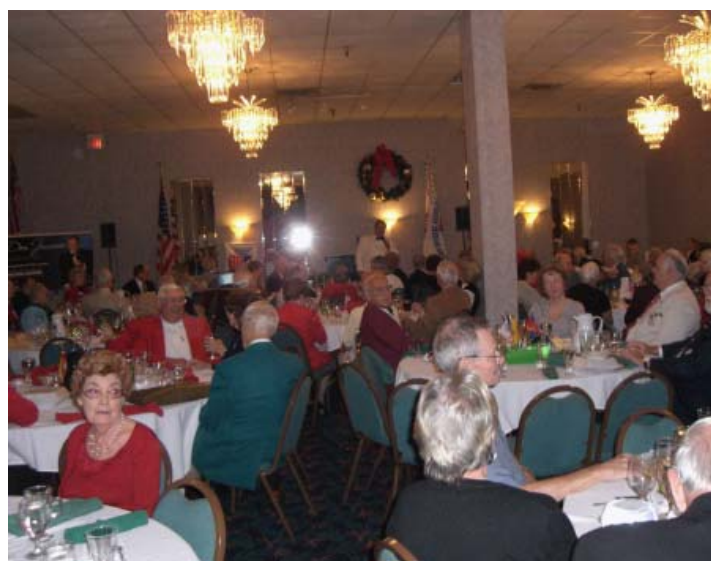
We had a large, happy crowd!