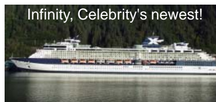
Infinity, Celebrity's newest!